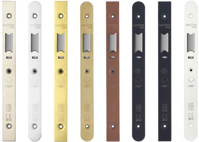
SSS PSS PVDG PVDB PVDBZ PVDBLK PCB PCW