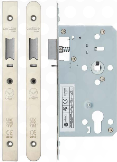
VDL7260NL-SSS / VDL7260NL-R-SSS